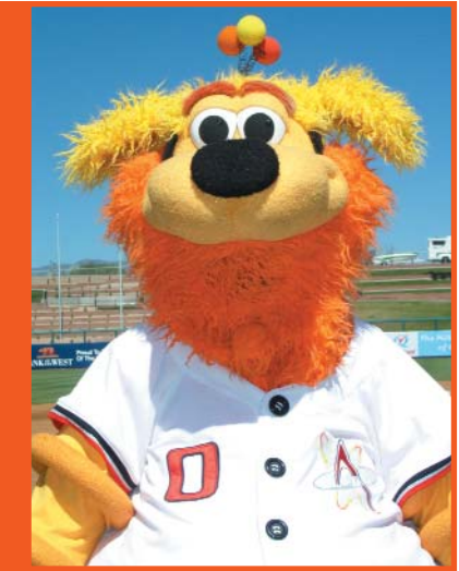
THE GREAT MYSTERY: This Goofy lookalike will reveal his heritage sometime this season.

If you account for Orbit's bright red, orange and yellow antennae, he measures in at 6-foot-5-inches tall, 72 inches around, and weighs a hefty 300 pounds. While many attribute his massive size to his perpetual devouring of Dion's cheese pizza, popcorn, and green chile